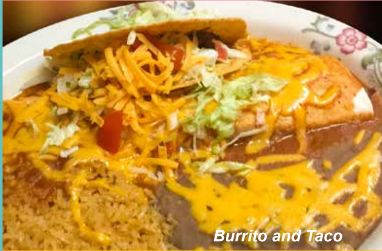
Burrito and Taco