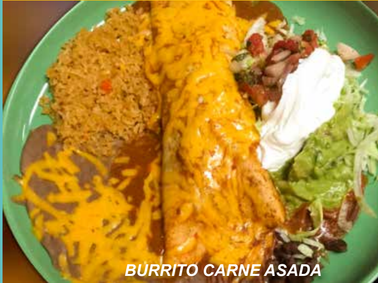
BURRITO CARNE ASADA

Two enchiladas filled with your choice of cheese, chicken, beef, pork or shredded beef topped with green tomatillo sauce and melted cheese 11.29