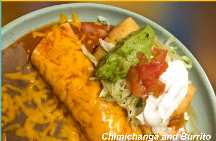
Chimichanga and Burrito